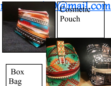
info@nativegirl40.com Cosmetic Pouch

I make these bags upon request, some I have in inventory but not all. You can inquire by e-mailing