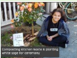
Composting kitchen waste & planting white sage for ceremony