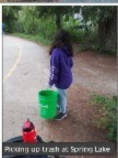
Picking up trash at Spring Lake