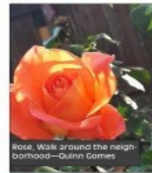
Rose, Walk around the neighborhood—Quinn Gomes