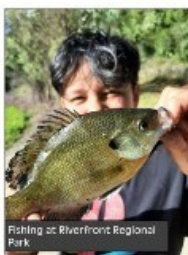
Fishing at Riverfront Regional Park