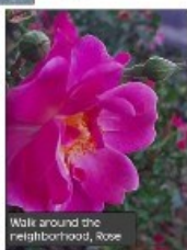
Walk around the neighborhood, Rose